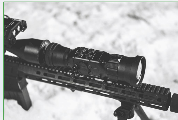
Thermal Imaging Systems