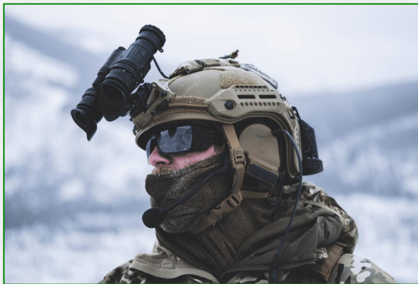
Night Vision Systems