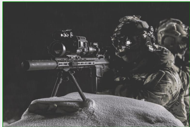
Advanced Detection Solutions