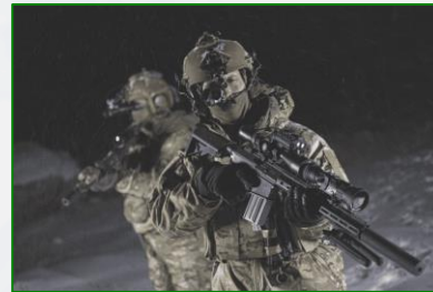
OEM Kits and Solutions